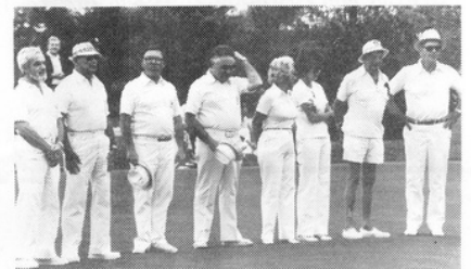
The Canadian and Bermuda teams are introduced during Pommery Champagne Picnic and Exhibition matches prior to the US International Challenge Cup.